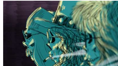
Clip 7: Timecode: 00:17:09 - 00:19:14 Project title: GnR Client: Personal Project Contribution: Animation, design, compositing