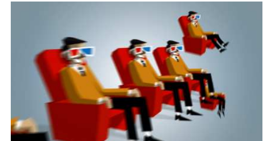
Clip 20: Timecode: 00:49:23 - 00:51:21 Project title: ADmerica Image film Client: ADmerica Contribution: Animation, design, compositing