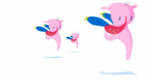
Clip 10: Timecode: 00:27:08 - 00:30:06 Project title: Dancers Client: Personal Project Contribution: Animation, design, compositing