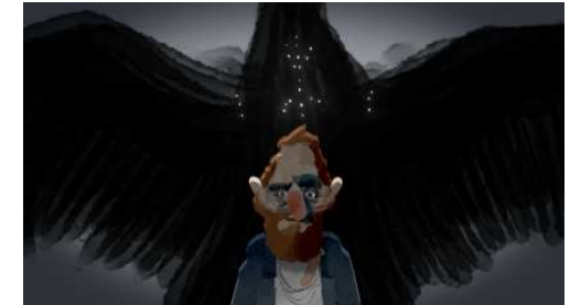
Clip 4: Timecode: 00:11:07 - 00:13:06 Project title: Blaa Kors Imagefilm Client: Blaa Kors Contribution: Animation, design, compositing