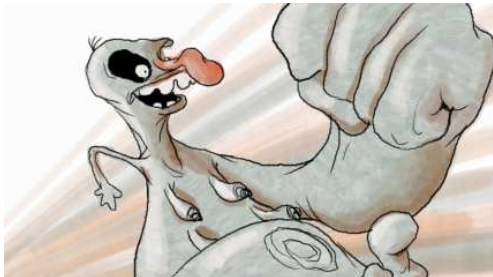
Clip 21: Timecode: 00:51:22 - 00:52:21 Project title: Deborah Client: Personal Project Contribution: Animation, design, compositing