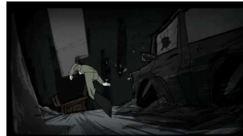
Clip 19: Timecode: 00:48:08 - 00:49:22 Project title: Lucky Strike Client: The Danish National Film School / Cav Bøgelund Contribution: Compositing