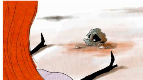
Clip 14: Timecode: 00:39:07 - 00:40:22 Project title: Deborah Client: Personal Project Contribution: Animation, design, compositing