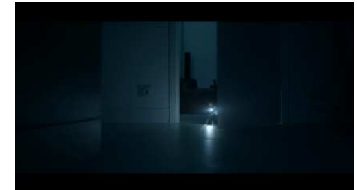
Clip 8: Timecode: 00:19:15 - 00:25:08 Project title: "I am here" Aka. "The 11th Hour" Client: Zentropa / Anders Morgenthaler Contribution: On Set VFX supervision, Cleanplates, 3D particle generating, Compositing