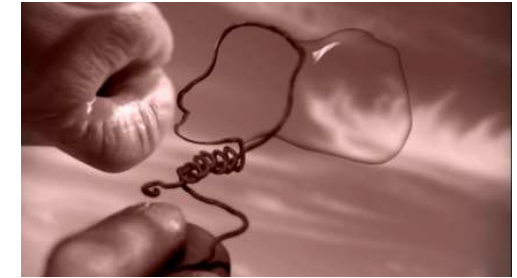
Clip 16: Timecode: 00:42:17 - 00:44:02 Project title: Kid Client: Personal Project Contribution: Animation, design, compositing