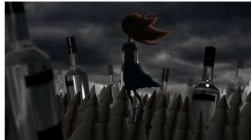
Clip 18: Timecode: 00:46:02 - 00:48:07 Project title: Blaa Kors Imagefilm Client: Blaa Kors Contribution: Animation, design, compositing