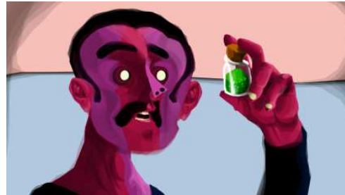
Clip 2: Timecode: 00:07:22 - 00:09:19 Project title: The Animation Tag Attack Client: Personal Project Contribution: Design, animation, motion tracking, compositing