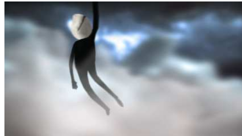
Clip 6: Timecode: 00:15:08 - 00:17:08 Project title: The Animation Tag Attack Client: Personal Project Contribution: Animation, design, compositing