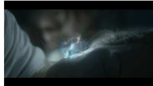
Clip 3: Timecode: 00:09:20 - 00:11:06 Project title: "I am here" Aka. "The 11th Hour" Client: Zentropa / Anders Morgenthaler Contribution: On Set VFX supervision, Cleanplates, 3D particle generating, Compositing