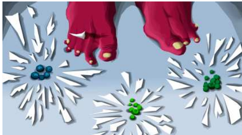
Clip 17: Timecode: 00:44:03 - 00:46:01 Project title: The Animation Tag Attack Client: Personal Project Contribution: Animation, design, compositing