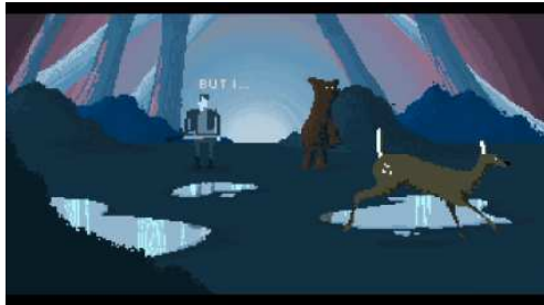
Clip 1: Timecode: 00:05:00 - 00:07:21 Project title: Bear Utitled Client: Personal Project Contribution: Animation, design, compositing