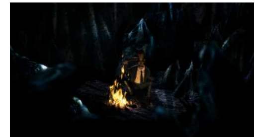
Clip 12: Timecode: 00:31:07 - 00:33:07 Project title: Jona, Tomberry Client: Studio Rosto AD Contribution: Background design, compositing