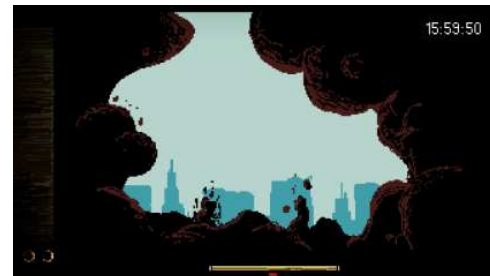
Clip 11: Timecode: 00:30:07 - 00:31:06 Project title: 10 past 911 Client: Canal+, France Contribution: Animation, design, compositing