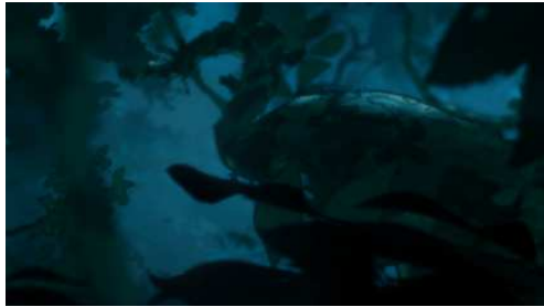
Clip 13: Timecode: 00:33:08 - 00:39:06 Project title: the Apple & the Worm Client: Copenhagen Bombay Contribution: Camera move, 2,5D compositing