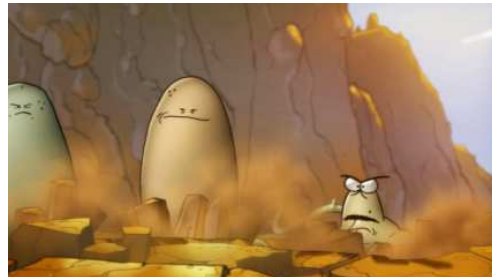
Clip 22-23: Timecode: 00:52:22 - 00:54:19 Project title: the Apple & the Worm Client: Copenhagen Bombay Contribution: Compositing