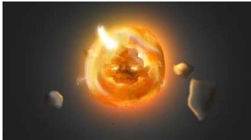
Clip 5: Timecode: 00:13:07 - 00:15:07 Project title: Goodbye good heart Client: Personal Project Contribution: Animation, design, compositing