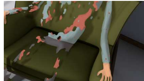
Clip 24: Timecode: 00:54:20 - 00:56:05 Project title: Blaa Kors Imagefilm Client: Blaa Kors Contribution: Design, compositing